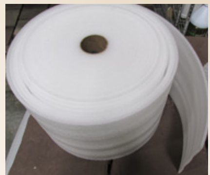
Closed cell ¼ inch foam roll

We hope that information presented here is helpful. It is based on data considered to be true and accurate, and reflects our best understanding and knowledge, presented for the user's consideration. We do not warrant results of action based on any of the information contained. No statement, recommendation or suggestion is intended to infringe on any patent or copyright.