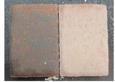
Photo left - ColorScape® EverBold® pavers in left 4 rows. Standard pavers from the same pallet and production run in right hand row. Photo taken several days after manufacture.

Photo top - ColorScape® EverBold® and standard pavers exposed outdoors for 8 months after manufacture.